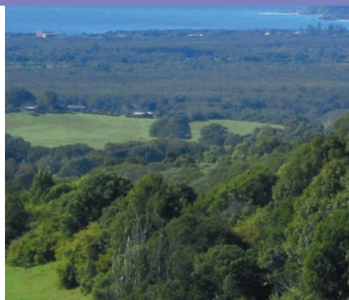
Eastern Australia coastline

Sandalwood has been valued in India for at least 2,000 years as one of the most sacred trees. The wood has been—and is—used in making various religious artifacts, a paste for marking the skin, coffins and was even used in early buildings. It was an important medicinal herb in traditional Chinese and Tibetan medicines and has been a critical perfumery component for more than 2000 years. The main source of sandalwood oil is a very slow-growing tree in India often damaged by fire, pests, disease and poaching. In spite of the Indian government's efforts, the number of mature sandalwood trees in India is declining. Aura Cacia ® now sources sandalwood oil exclusively from Australia, where a program of controlled harvest and aggressive reforestation provides a truly sustainable source.